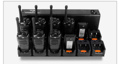
6, 12, or 18 Bank Charger