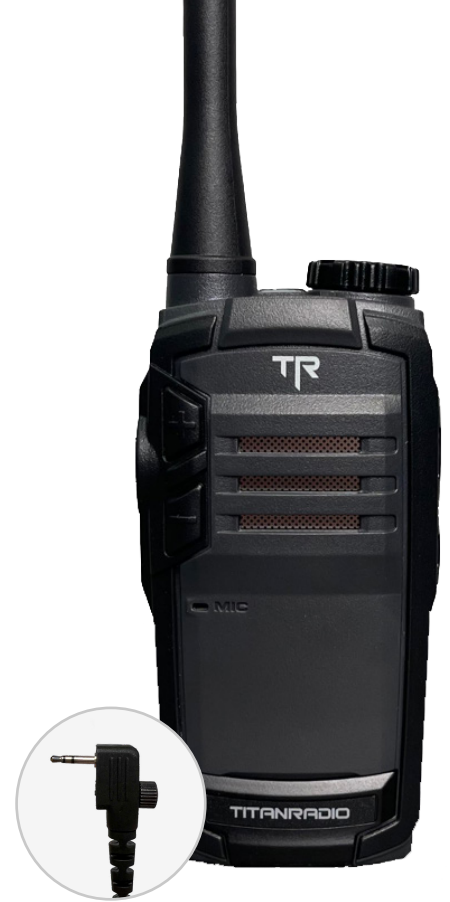
Single-Pin Screw-Down Connector